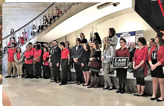
Students for Life at Pro-Life Action Day show the pro-life message continues to be in good hands!