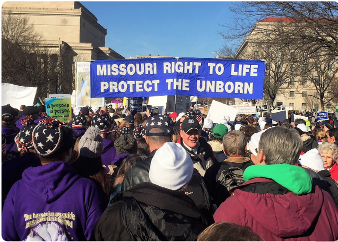
Missouri Right to Life joins hundreds of thousands at the 2018 March for Life.