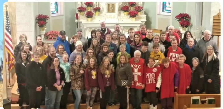
March for Life participants from Villa Ridge, Sullivan, and the East Central Area Chapter-MRL ready to head to Washington.

. . . at "Show Me Life" Pro-Life Action Day