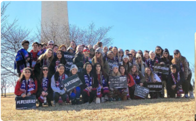
The 2018 March for Life once again brings thousands of young pro-lifers to D.C. As they say, "We are the pro-life generation!"