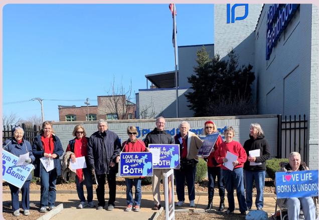
Above - The ever-faithful MRL-East Central Area Chapter members stand in prayer and petition at Planned Parenthood during spring 40 Days for Life.

(Right and below) March to the Arch was a huge success for the many pro-life groups and individuals who came together to walk from Planned Parenthood to the arch declaring "Life Is Beautiful!"