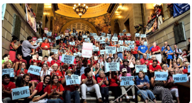
Pro-lifers gather on the steps of the Missouri Capitol rotunda to support the special legislative session to consider new pro-life regulations.