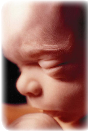
20-week unborn baby