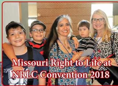
Missouri Right to Life at NRLC Convention 2018