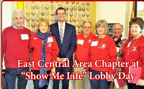
East Central Area Chapter at "Show Me Life" Lobby Day