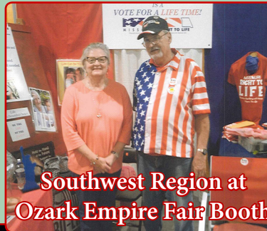
Southwest Region at Ozark Empire Fair Booth