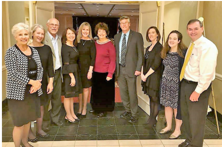
The committee who planned the evening did a commendable job!