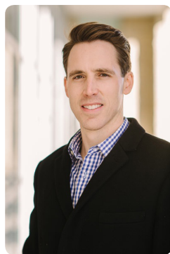
Senator-Elect Josh Hawley