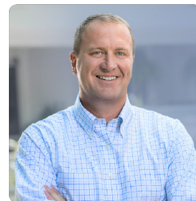
Attorney General-Elect Eric Schmitt

Congratulations to Missouri’s Attorney General-Elect Eric Schmitt and his family!