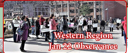
Western Region Jan 22 Observance