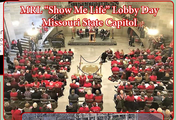
MRL "Show Me Life" Lobby Day Missouri State Capitol