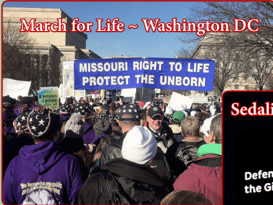
March for Life ~ Washington DC

You made good things happen all year long!