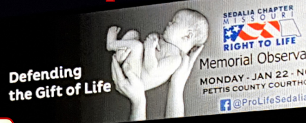
Sedalia Chapter Billboard