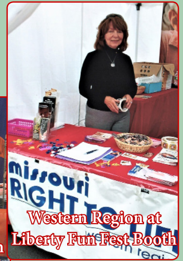
Western Region at Liberty Fun-Fest Booth