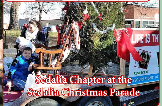
Sedalia Chapter at the Sedalia Christmas Parade