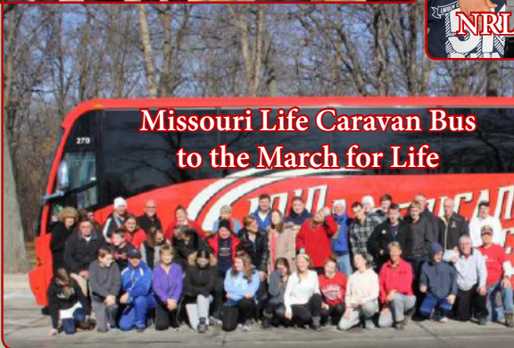
Missouri Life Caravan Bus to the March for Life