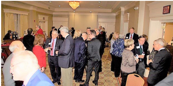
(Left) A few of the guests gather before dinner to enjoy each other's company and to celebrate life. Thanks for being there!