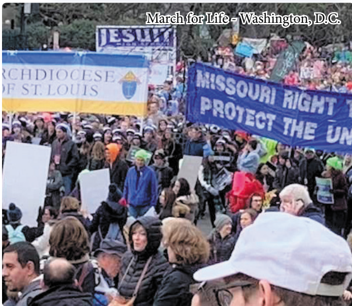
March for Life - Washington, D.C.

On January 24, Missouri Right to Life members and pro-lifers from across the state joined hundreds of thousands of like-minded people in Washington, D.C., to mark 47 years of abortion-on-demand. As always, the mainstream media refused to give other than token coverage.