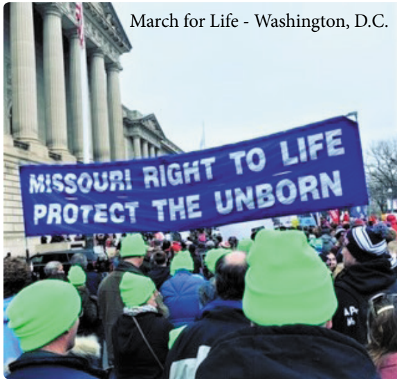
March for Life - Washington, D.C.