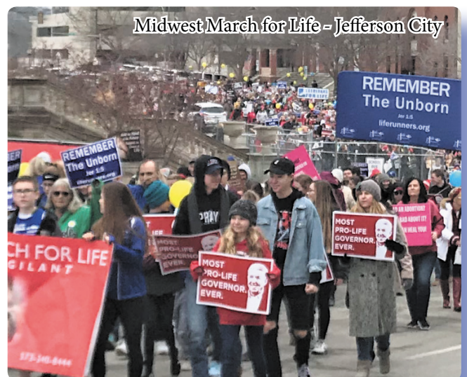
Midwest March for Life - Jefferson City

Missouri Right to Life thanks those who honor their deceased loved ones or who celebrate an important event by making a gift to MRL.