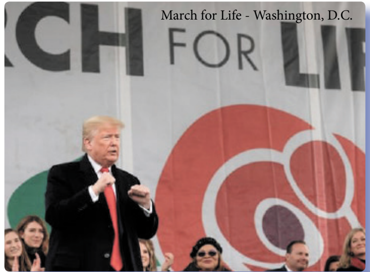
March for Life - Washington, D.C.