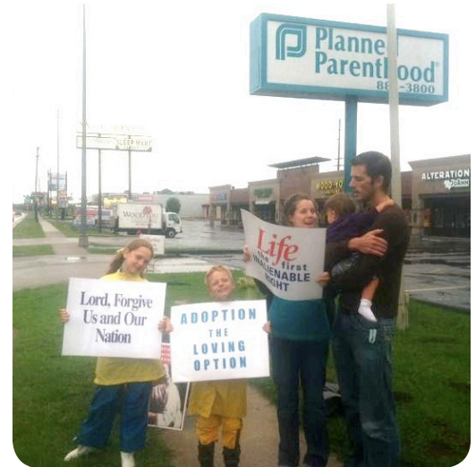
Valiant pro-lifers singing praises on a rainy day as they stand opposed to abortion at the Springfield Planned Parenthood.

The reason I decided to leave you this note is to tell you that what you did was good. I felt I owed it to you for all the days you stood there in hope that others would take notice. I noticed. In turn it gave me hope that others I