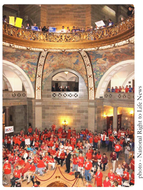
Hundreds of pro-lifers attend the Sept. 10th veto session to proclaim support for protections for women and for babies.

House Bill 1132 increases the maximum funding available for pregnancy resource cen-