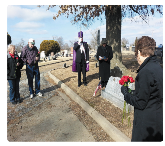
(Above) The Sedalia Chapter-MRL commemorates the 42nd anniversary of Roe v. Wade with a service to place roses at Sedalia's memorial to children killed by abortion.