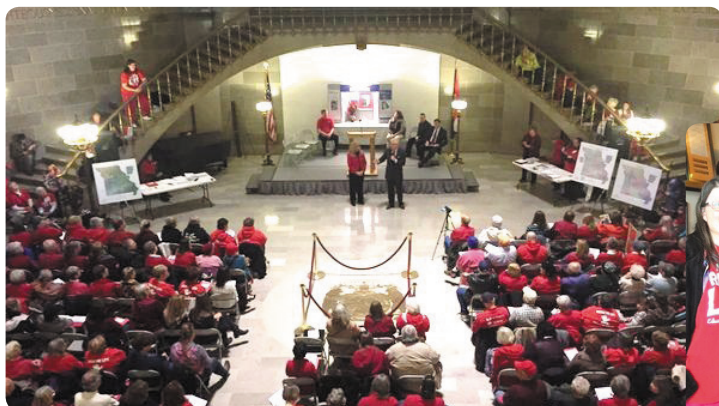
Above - Pro-lifers listen as Lt. Gov. Peter Kinder addresses life issues at the Noon Rally on Pro-Life Action Day.

To see the complete list go to our 2016 legislation page at: http://missourilife.org/legislation/index.html .