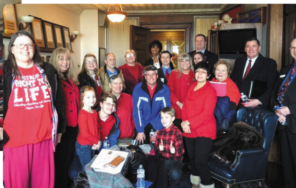
Left - Sen. Eric Schmitt (R-15) hosts a reception for pro-lifers attending the Feb. 9th Pro-Life Action Day. Thank you, Sen. Schmitt!