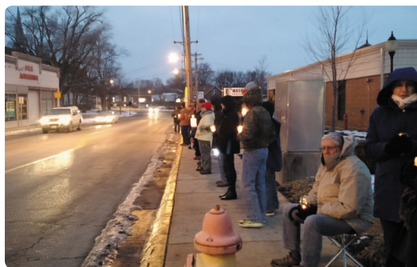
East Central Area Chapter-MRL Candlelight Vigil remembering 43 years of abortion on demand.

in my arms, feeling my heart fill with more love than I ever knew possible, has taught me a lesson I learned several years too late: a mother will do anything for her child.