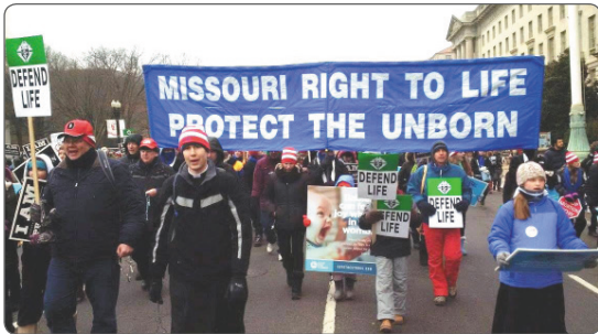
Missouri Right to Life at the 2016 March for Life in Washington, DC remembering 43 years of abortion on demand.

"While I hung pink butterflies and framed sonogram photos of this new baby, I had driven hours to give my first child death."