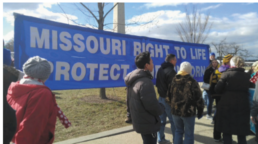
MRL ready to join the Washington D.C. March