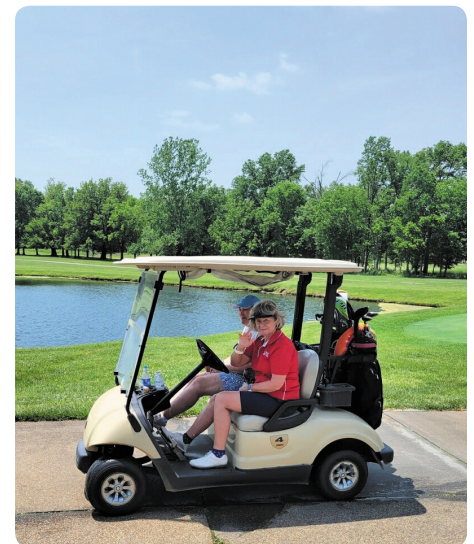
What a beautiful day for MRL Eastern Region's annual golf tournament! A good time was had by all, both enjoying the company and the golf and raising funds to spread the pro-life message. Thank you, golfers, for sharing your day with Missouri Right to Life!