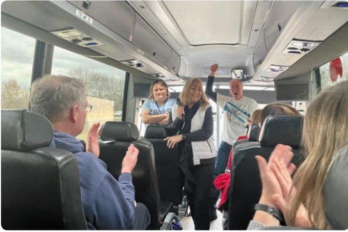
Prolifers on one of the Life Caravan buses from the St. Louis area on the way to March for Life in Washington, D.C. What an experience these bus rides always are!