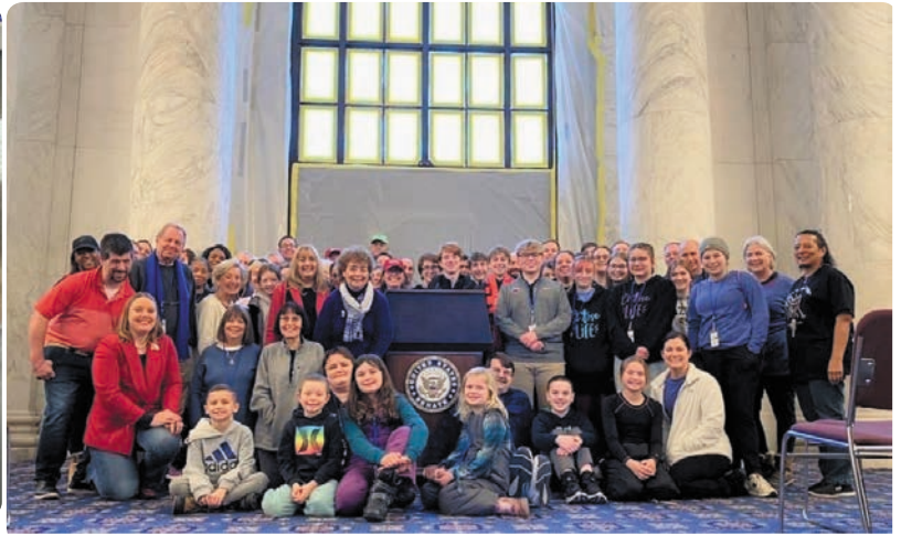
Missouri pro-lifers at the Legislator's Meeting prior to participating in the 2023 March in Washington, D.C.

Missouri Right to Life joined over 100,000 pro-lifers from across the country on January 20 in Washington D. C. to speak for the sanctity of life. This is the first March for Life since the Supreme Court overturned Roe v Wade.