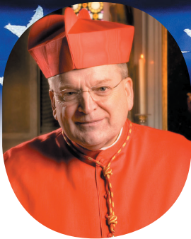
Champion of Life Award Recipient