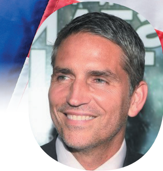
Featured Speaker Actor Jim Caviezel