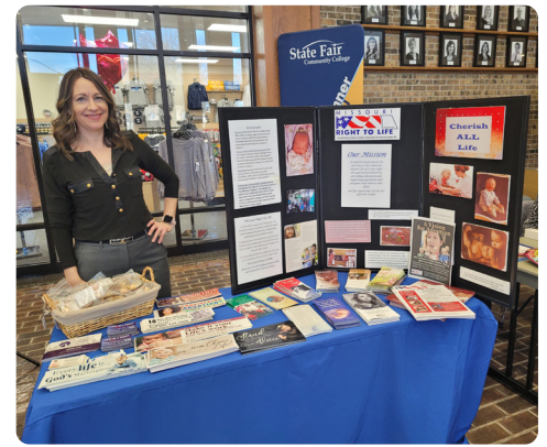
MRL Sedalia Chapter volunteer working the exhibit in March at the event fair at State Fair Community College.

Columbia - Fall 40 Days for Life Campaign - Is your church, youth group, or organization looking to adopt a day or multiple days to join trained prayer supporters on the sidewalk? Now is a good time to start planning! There are prayer opportunities year-round! Call 573-821-5130 for more information.